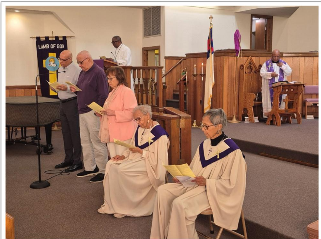
St. Cyprian's parishioners were asked to re-enact The “Passion” Narrative.