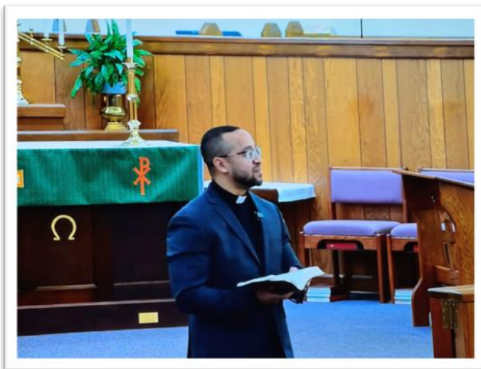
MINISTRY OF THE WORD...