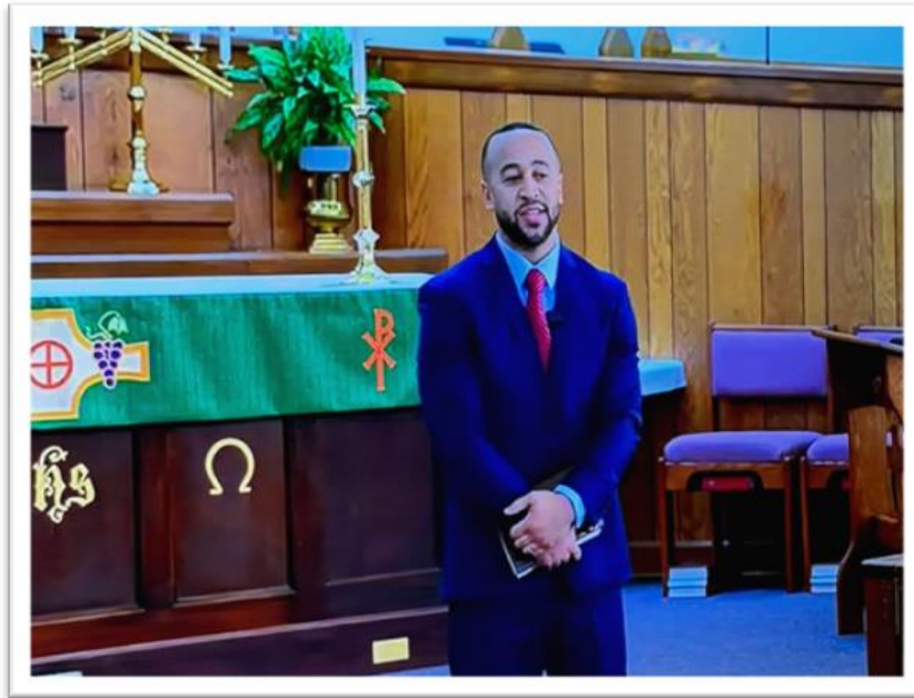
GREETINGS TO THE VIEWING AUDIENCE...